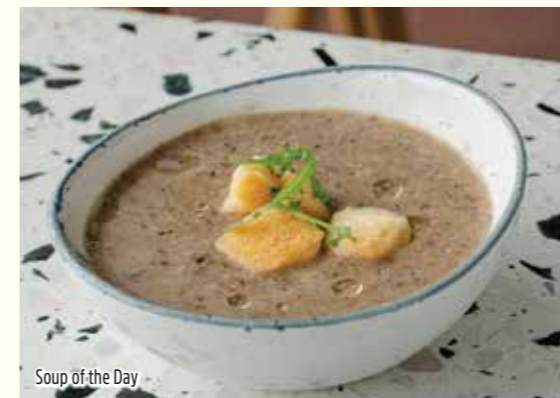
Soup of the Day

Soup of the Day or Desserts: • Chef's Granita • Panna Cotta • Cake Special