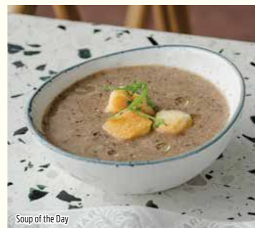
Soup of the Day

Soup of the Day or Desserts: • Chef's Granita • Panna Cotta • Cake Special